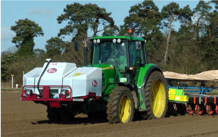
1500L version shown (2014 onwards)