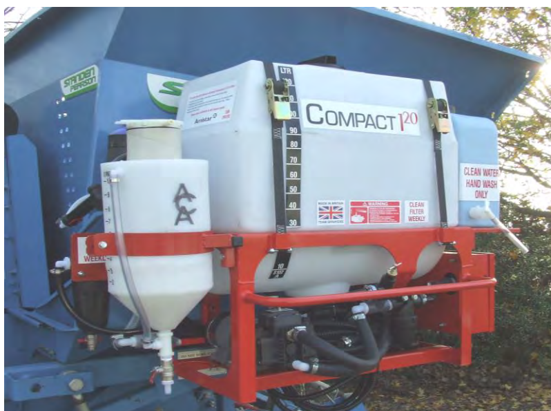
120Ltr version with ACA chemical injection