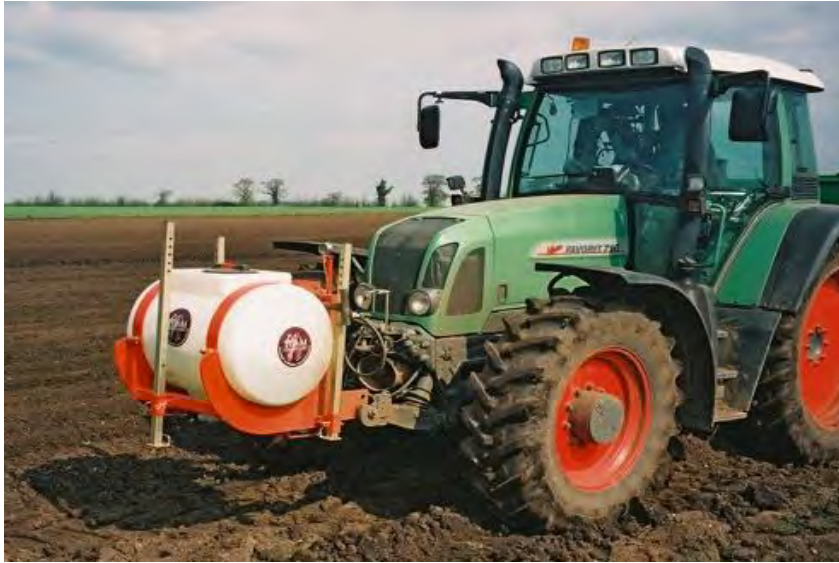
250Ltr version shown